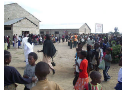
New Dining Block in the background behind the Church