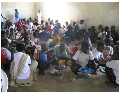
Feeding time at Kabwe