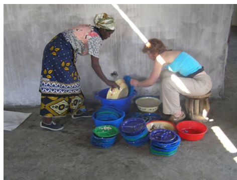
Cleaning up after feeding!