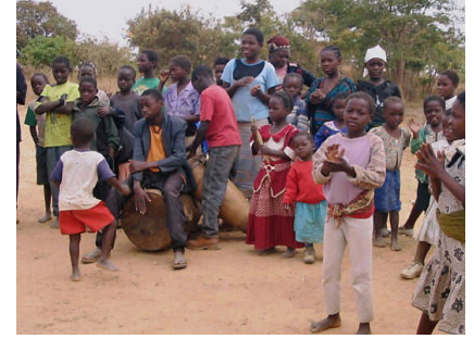
Children at the N'Gombe School

With us we took lots of equipment for the school, most of which was generously donated by local residents and businesses. This included hundreds of exercise books, pencils, colouring pencils, rubbers, sharpeners, skipping ropes, beads, balls, rugby balls, and many more games. They were all thrilled to receive these gifts and we had lots of fun showing them how to use it all. When we were there, the paper and stationary were put to good use through drawings the children did. Unexpectedly, all the children gave us their drawings as a present, which was really moving. They all had nothing, but they still had love, generosity and happiness.